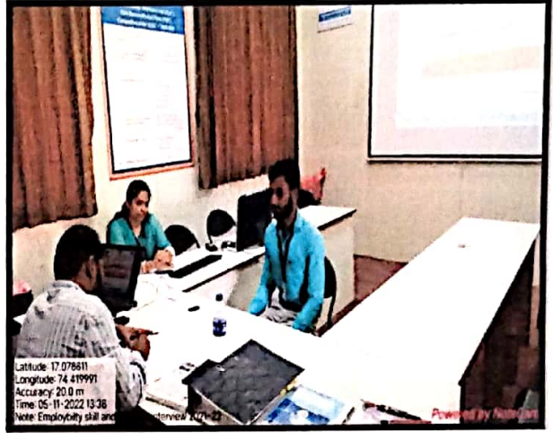
Campus Interview for UG and PG Students by Patil Group of Industry